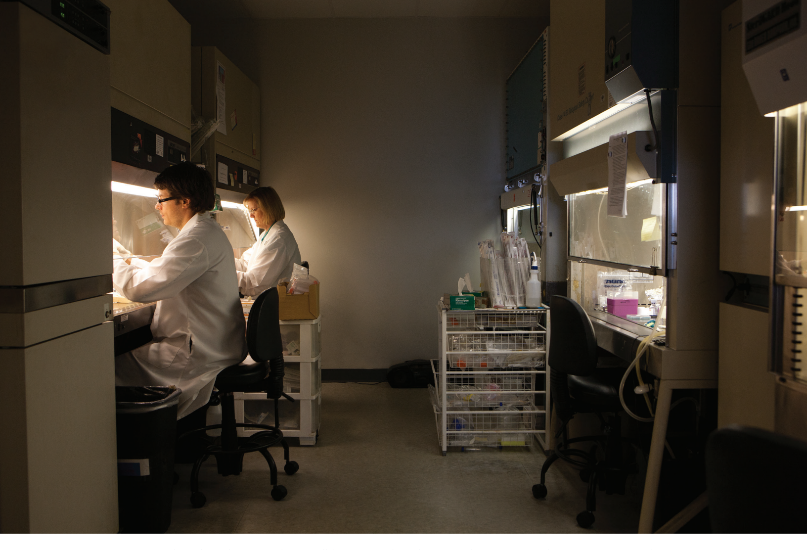
Cancer research and predictive analytics will be essential in identifying better approaches to prevention, detection, treatment and cures.