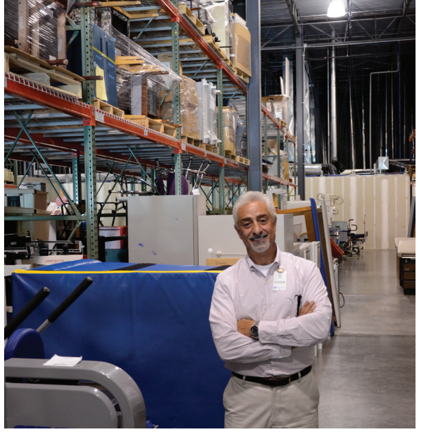
The clinical asset management warehouse in St. Louis is available as a resource for all BJC Collaborative members.

In addition to bundling clinical equipment purchases, BJC's clinical asset management warehouse in Fenton redeploys recovered equipment and supplies to other BJC facilities and Collaborative members at a fraction of the cost of purchasing those same items new.