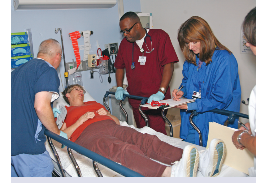
Mock patient drills enable hospitals to prepare for crisis response. BJC Collaborative member hospitals can provide mutual aid in the event of a disaster.

The BJC Collaborative also has opened up opportunities for consulting and management services among members. For example, BJC and Washington University School of Medicine have established agreements to assist Southern Illinois Healthcare in attaining a higher designation level for services currently provided. Barnes-Jewish Hospital and the Medical School are providing consulting and management services to help Southern Illinois Healthcare attain a Level II Trauma designation, and St. Louis Children's Hospital and the university are providing consulting and management services to help the health care system attain a Level III Nursery status.