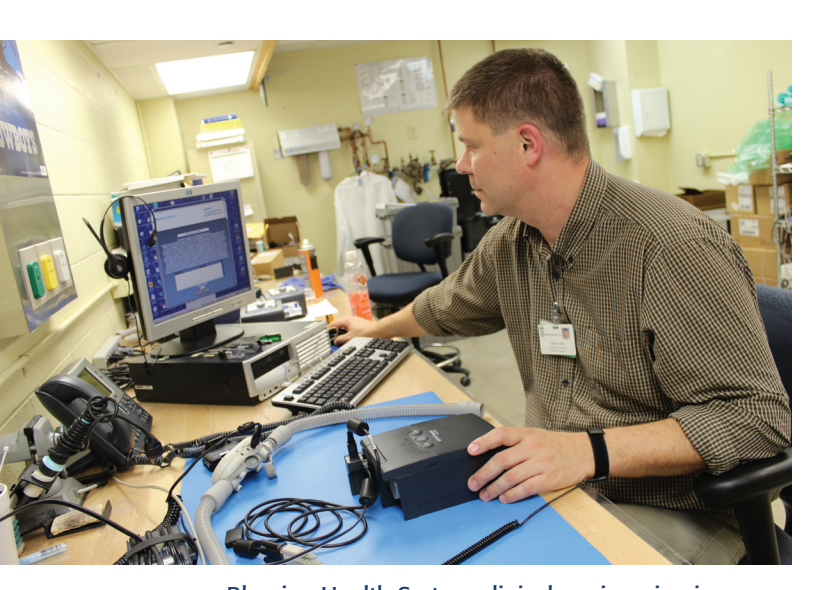
Blessing Health System clinical engineering is among BJC Collaborative members achieving savings through bundled purchases of clinical equipment.

The capital equipment bundle includes 2,219 devices as of mid-2017 and covers a variety of devices such as imaging equipment, anesthesia equipment, stretchers and surgical devices.